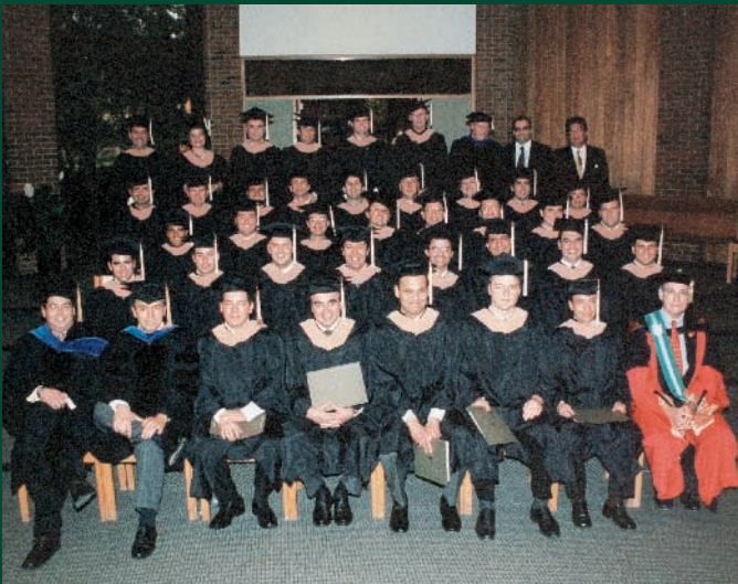
The 2001 Chilean executive MBA class celebrated their graduation with a convocation ceremony in Myra Clare Rogers Memorial Chapel on Nov. 9. The ceremony was followed by a reception at the Plimssoll Club.